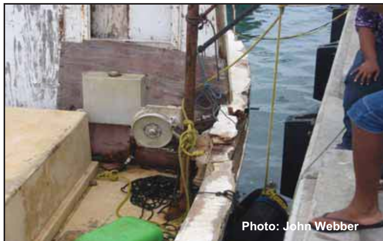
Point Wharf, St. John’s Harbour: vessel with damaged gunwale