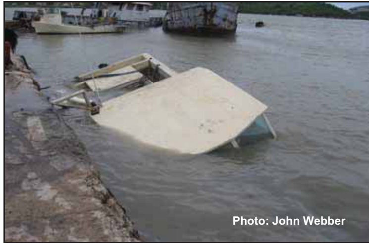
Bryson Wharf, St. John’s Harbour