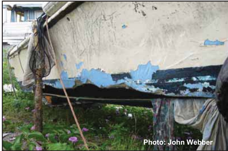
Bryson Wharf, St. John’s Harbour: vessel with hull severely damaged